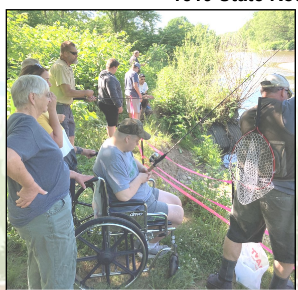
Volunteers and guests fishing during our Annual Fish 'n' Fun event in June

Work on the conservation buffer projects at Kocher Park and Johnson Flats is underway with the removal of invasive species and preparation of the site for plantings. The projects are expected to be installed by July of 2023.