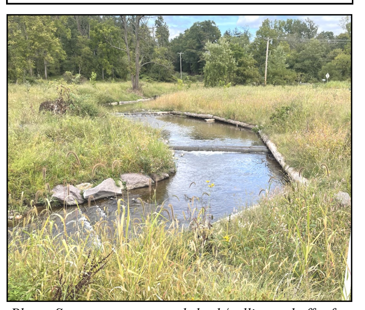
Photo: Stream structures and shrub/pollinator buffer for erosion control and fish habitat installed on East Branch Briar Creek, Berwick.