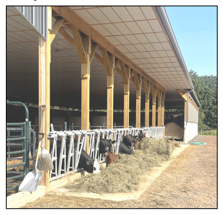
Completed Heavy Use Area with ACAP and CAP funding, Roaring Creek Township

2023 ACAP projects included an access road and fencing in Locust Township as well as a Heavy Use Area (HUA) in Roaring Creek Township. Projects planned for 2024 include a HUA and manure storage structure, fencing and off-stream watering, grazing improvements, silvopasture, and grass waterways, totaling $985,000.