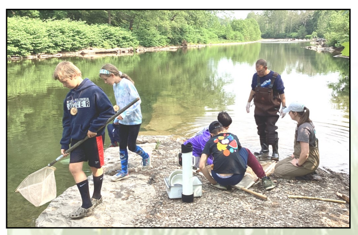
Photo: Kids exploring macroinvertebrates at Outdoor Adventure Camp held at Kocher Park in June.

The conservation buffer projects at Kocher Park and Johnson Flats, including the removal of invasive species, planting of pollinator meadows, native trees and shrubs were completed this summer. Streambank stabilization work was completed at the end of December.