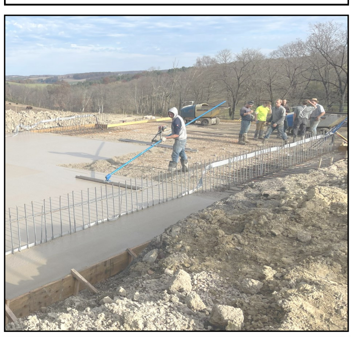
Workers pour the floor of a manure storage structure funded by a National Fish and Wildlife Foundation grant, Benton Township

To lead the citizens of Columbia County in sustainable use of our shared agricultural and natural resources through partnerships, education, and technical assistance, in order to assure the best quality of life for future generations.