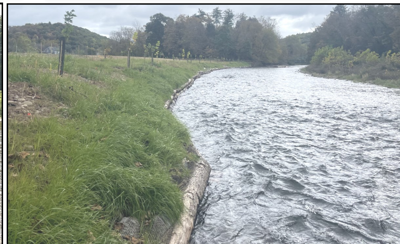
Before and after images of a section of Fishing Creek in Benton Township. 520 linear feet of modified mudsill and a 50-foot wide buffer were installed this summer.