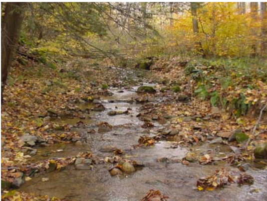
The natural beauty and function of Briar Creek watershed is threatened by poorly-planned development, improperly managed agriculture, unchecked stormwater runoff and other hazards.

Encompassing 32 square miles and draining 19,500 acres, the Briar Creek Watershed drains away all the water that rains or snows on sections of North Centre township, Briar Creek township and Borough and part of the Borough of Berwick. But along with that water comes road salt, pesticides, excess fertilizer, unnatural sediment load and trash that is in that area. B.C.A.W.S. is a group of concerned people who live and work in the watershed. We want to make sure that Briar Creek and its watershed are protected from these threats and that it continues to be a source of drinking water, recreation and pride for generations to come. We need your help to do this. Members of the public are invited to attend our meetings and encouraged to become members themselves. Sign up today!